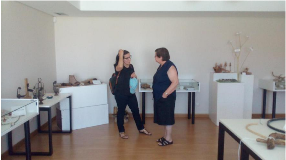
The coordinators of the exhibition and the showroom.

The cultural activity is a very remarkable field in the region and a reason of social cohesion. Linked to this and to the project works in this area with the local University students was decided to produce and organise an exhibition of their works along the course and we decided to support this initiative with a public exhibition for the community. With this initiative we intend to show the practical results of the module “Cultural Activity” in our country.